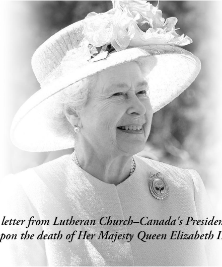
A letter from Lutheran Church–Canada's President upon the death of Her Majesty Queen Elizabeth II